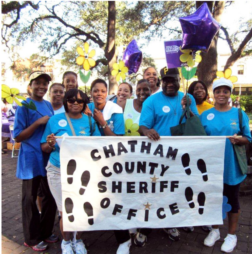
Above: The CCSO's Team St Lawrence was well represented at this fall's Walk to End Alzheimer's in Savannah's Johnson Square